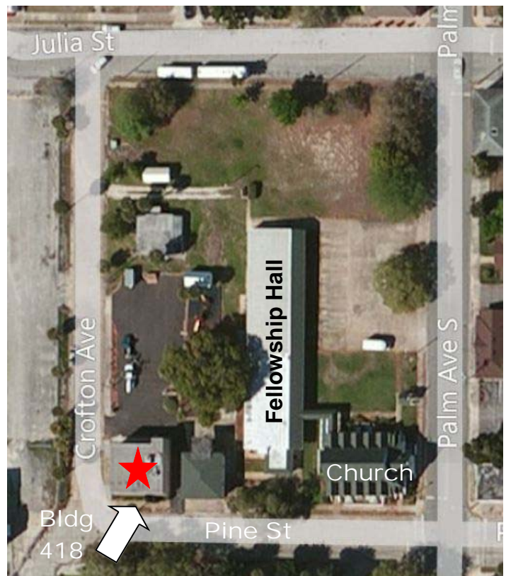
St. Gabriel's Church Complex